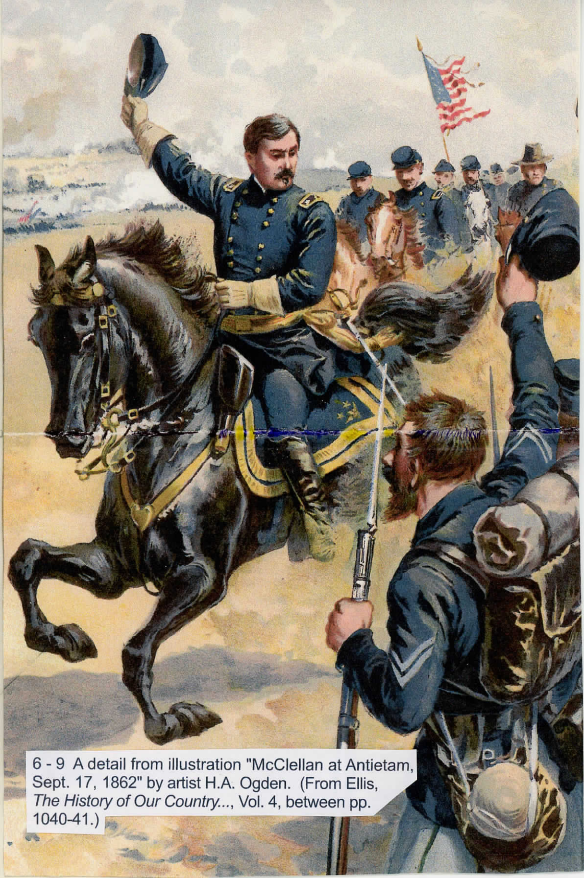
6 - 9 A detail from illustration "McClellan at Antietam, Sept. 17, 1862" by artist H.A. Ogden. (From Ellis, The History of Our Country... , Vol. 4, between pp. 1040-41.)